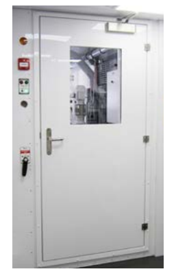
Sound insulating doors and windows for engine room