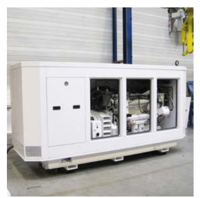
Sound insulating enclosures for gensets