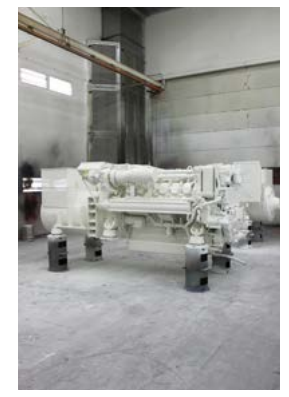
Wet-paint & coating of gensets