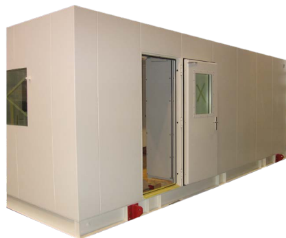
Walls and doors